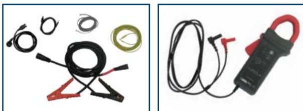
Testing cables and current clamp