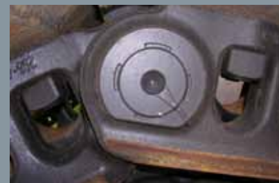
PPR2 Track resists link end play, increasing seal life and maximizing track life.

When your track does need repair, we have the trained professionals, proper equipment, and excellent parts availability to get your machine back running quickly and reliably.