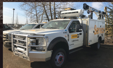
NightRider™ LEDS proudly supplies all Finning Service Trucks with LED lights.

ON OR OFF-ROAD, FOR WORK OR FUN, WE HAVE YOUR EXTRA LIGHTING NEEDS COVERED!