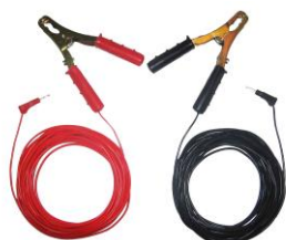
Voltage sense cables