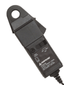
Current clamp 30/300A + cable set 5 m