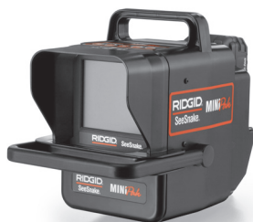
MINIPak Monitor Catalog No. 32748