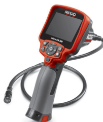
micro CA-300 Inspection Camera Catalog No. 37888