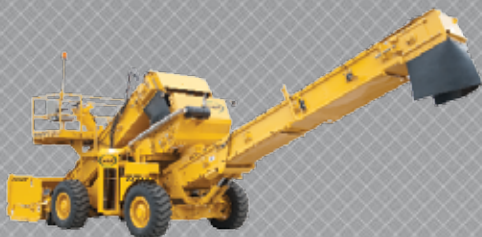
REMIXING TRANSFER VEHICLES

The tools you need for more profitable paving.