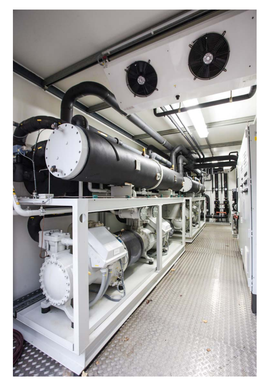
Figure 3: Industrial heat pumps installed alongside a G3516H gas generator set in a district energy plant in Reutlingen, Germany.