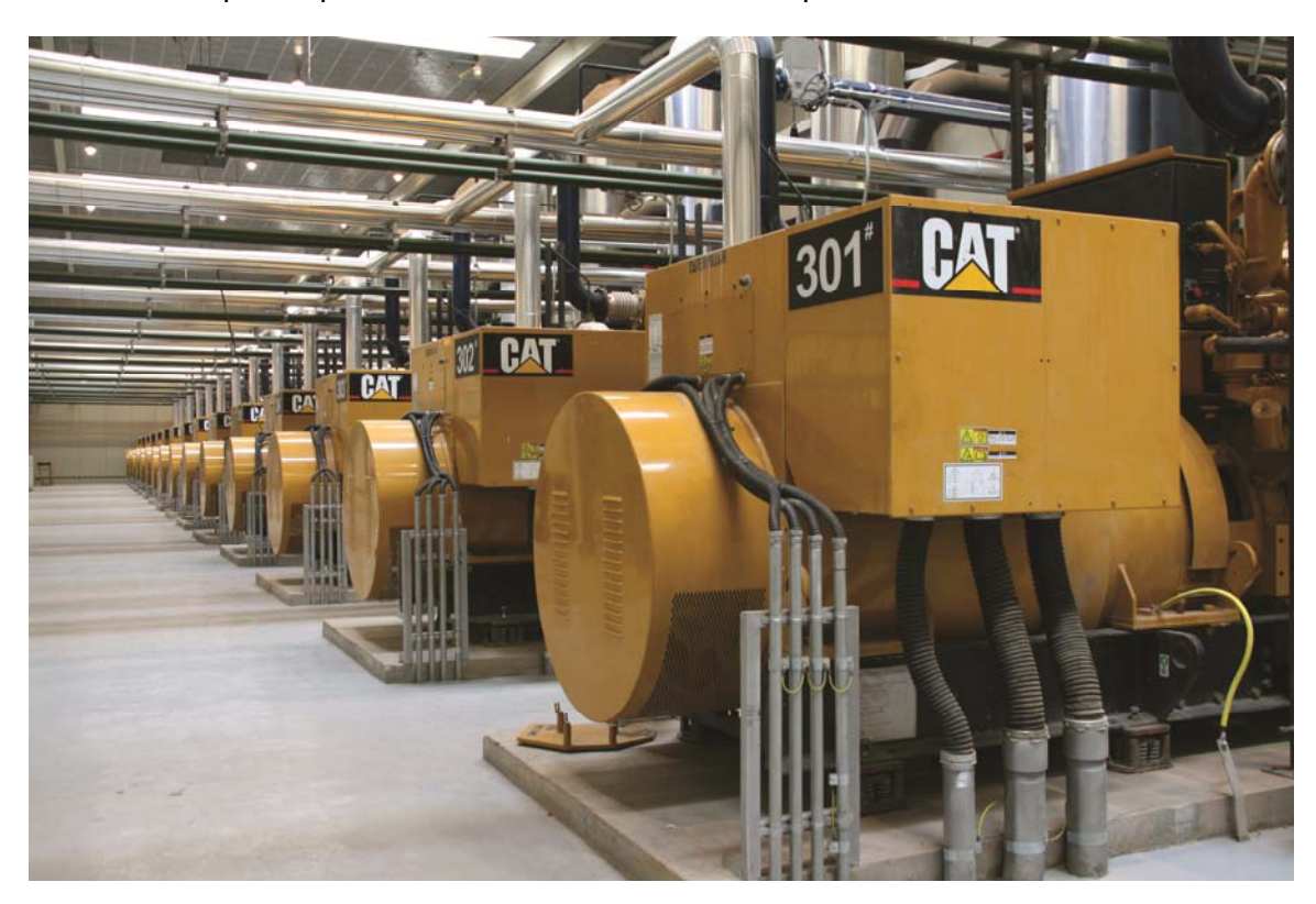
Figure 2: The interior of one of four coal gas power plants that utilize exhaust heat recovery steam generators to power a 3 MW steam turbine.

Shanxi Jincheng Anthracite Coal Mine Mining Company operates one set of facilities in Jincheng, Shanxi, China. The company collects coal gas from underground coal seams to power four separate power generation plants, each housing fifteen Cat G3520C high voltage generator sets that are integrated via Cat paralleling switchgear and controls. Each powerhouse is designed with a combined-cycle system that recovers waste exhaust heat to power a 3,000 kW steam turbine. The result of this heat recovery scheme is an additional 12 MW of electrical power to the local grid, which is equivalent to 10% of the power plants' 120 MW total electrical output.