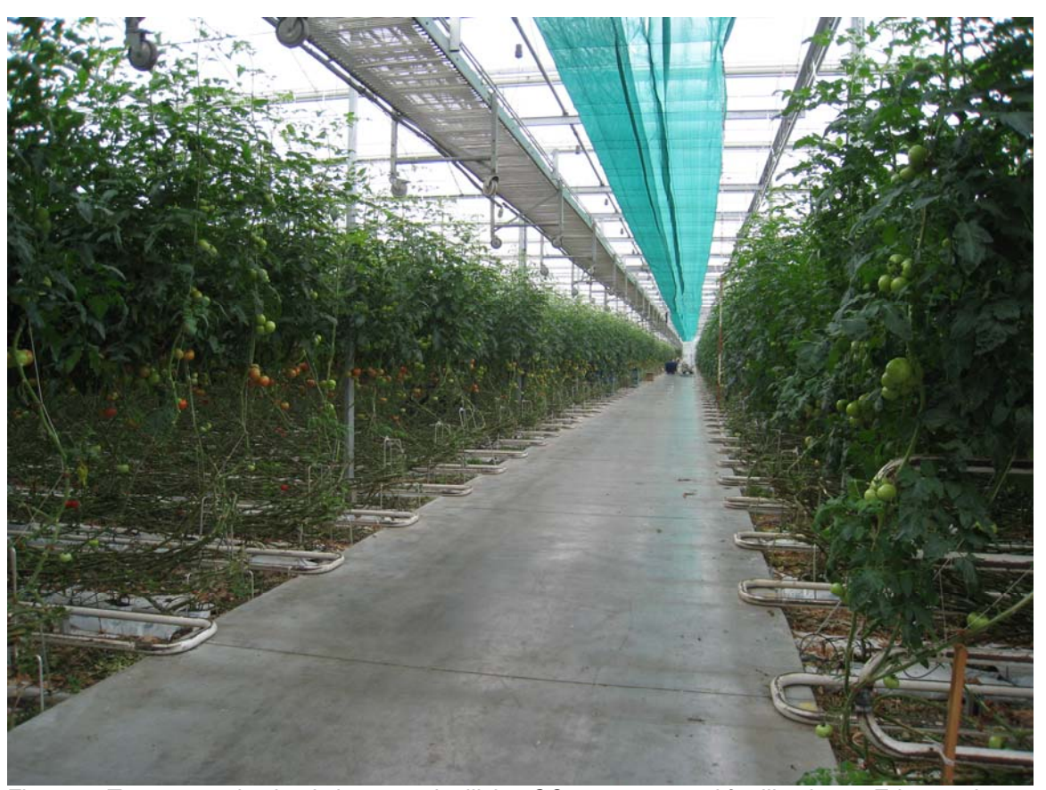
Figure 4: Tomato production is increased utilizing CO<sub>2</sub> recovery and fertilization at Eric van den Eynde Greenhouse.

At the Eric van den Eynde Greenhouse in Kontich, Belgium, 95 percent of the electricity generated is sold to the local electric utility based on the premium paid for high-efficiency power. The jacket water, exhaust, first stage aftercooler, and oil cooler heat from two G3516A (1,070 ekW each) generator sets and one G3520E (2,070 ekW) gas generator set are captured and stored in the form of hot water. The hot water is used to stabilize the greenhouse temperatures. Water with a temperature of up to 95° C (203° F) is stored in a 1,200 cubic meter (1,569 cubic yard) tank which acts as a thermal battery. The tank provides hot water at 45° C (113° F) via metallic tubes in the greenhouse. The temperature is maintained between 19° and 21° C (66° to 69° F) throughout the year.