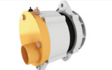
HIGH-CAPACITY ALTERNATOR 95-amp unit provides extra power for electrical accessories