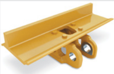
CENTER HOLE SHOES Reduce track packing and chain tightening, extend undercarriage life