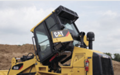
HYDRAULIC TILT CAB SYSTEM Improves maintenance access, increases uptime