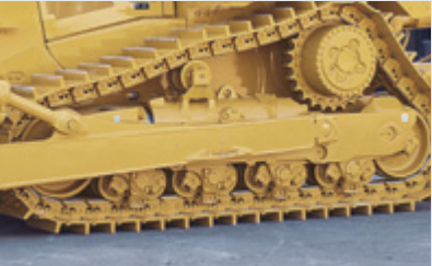
BOGIE SUSPENSION Keeps track on ground, improves stability