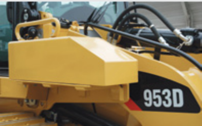
EXTRA FUEL TANK Extends time to refill