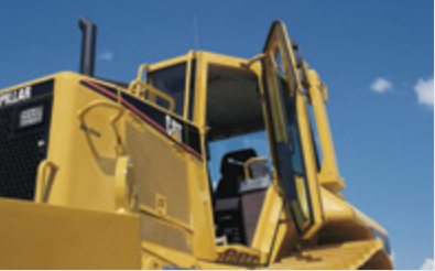
OPERATOR STATION Allows excellent visibility to material and blade for superior productivity and safety