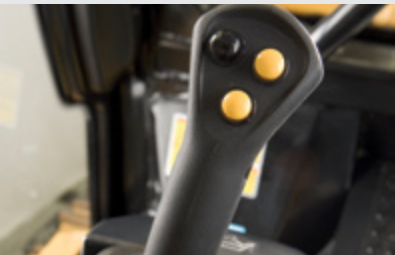
JOYSTICK STEERING Improves ease of operation, reduces training requirements