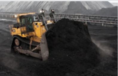
DRAWBAR PULL VS. SPEED Delivers unmatched lugging capability and smooth shifting under load